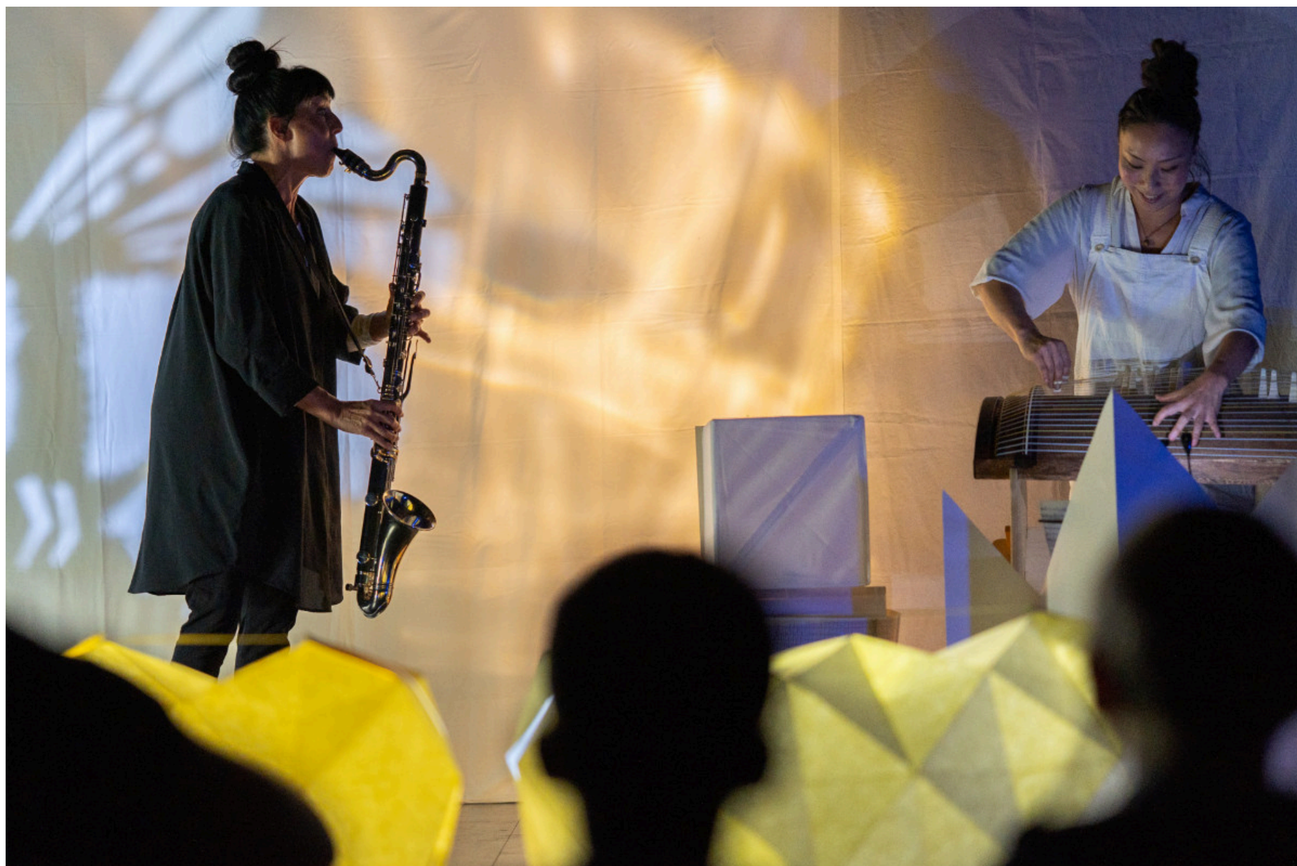
Showcase Yamesession, Bodø 2024

If the performance is booked minimum 6 performing days we can apply to the Swedish Arts Council for travel contribution and some support for the per diems and lodging cost. We can't promise that they will grant it but we will apply and also will check for other funds we can find for travel contribution.